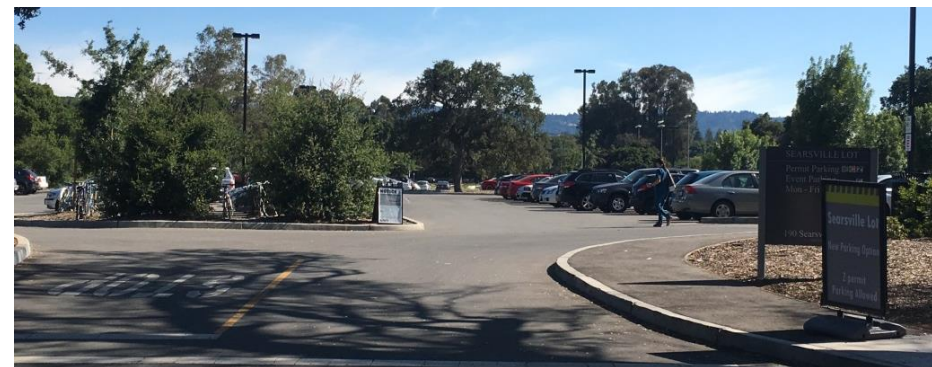
Searville Parking Lot Entrance